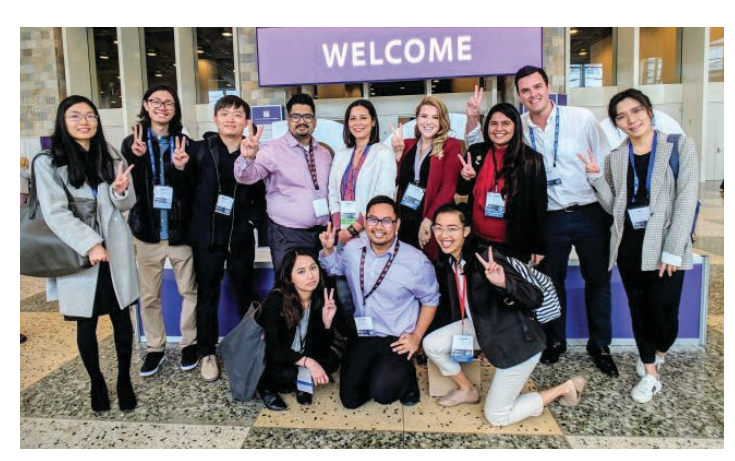
Members of the Associated Students of Planning and Development at the USC Price School of Public Policy celebrating their 2019 APA award

METRANS is a close partner of ASPD, funding many of its efforts and employing some of the student members.