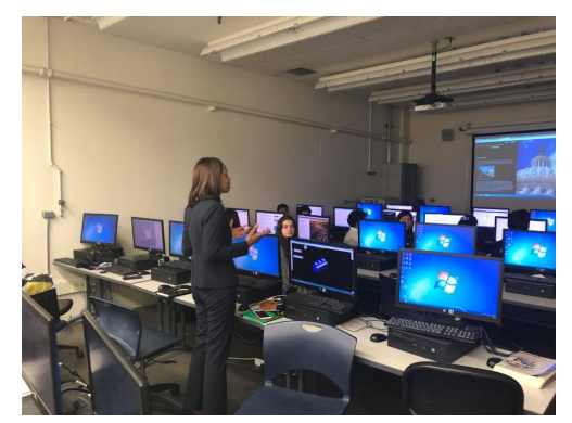
Federal Highway Administration