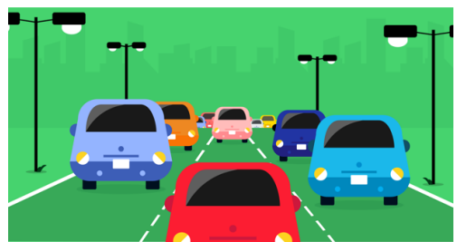
CityLab University: Induced Demand