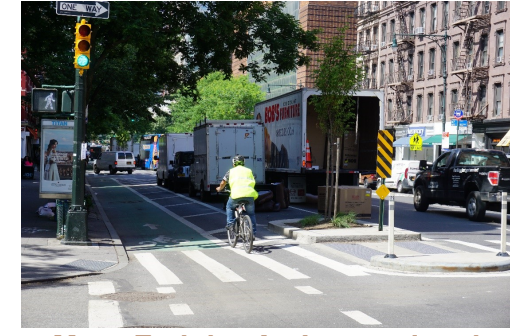
MetroFreight: An International Research Organization at the Service of Local Practice

Since its establishment in 1998, METRANS has conducted pioneering research in the fields of goods movement in metropolitan regions. In 2013, METRANS globally expanded its capacity for studying urban freight with the formation of MetroFreight, a Volvo Research and Educational Foundations Center of Excellence.