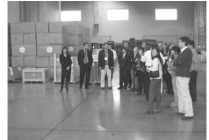
NUF attendees tour a Target Logistics facility.

Sponsor. The event was sponsored by METRANS,