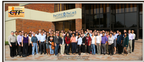
A throwback: Participants of the 2012 CTF Education Symposium.