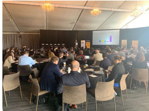
Participants at the 2019 INUF Conference.