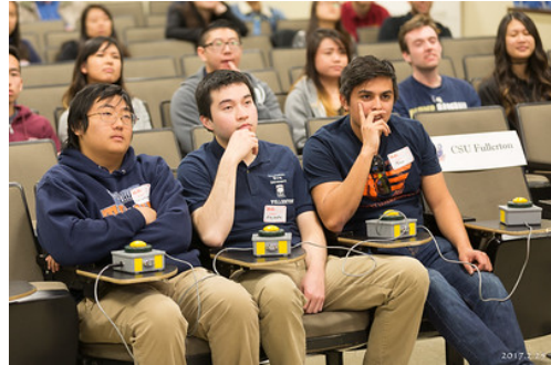
A team of transportation-focused students ponder the answer to a question in ITE's annual Traffic Bowl.