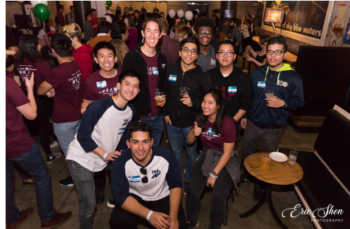
Civil engineering and urban planning students enjoying a social event for transportation-oriented students.