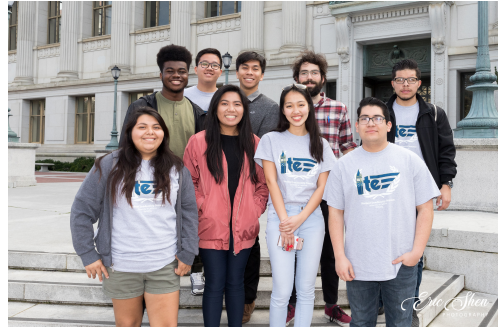
Members of LBSU's ITE student chapter during the annual Student Leadership Summit.