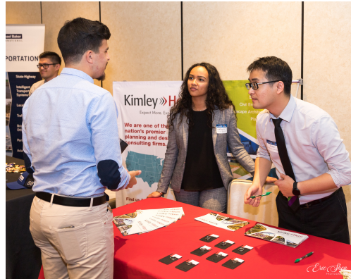
Students practiced networking skills with professionals at the career fair during ITE Student Night.