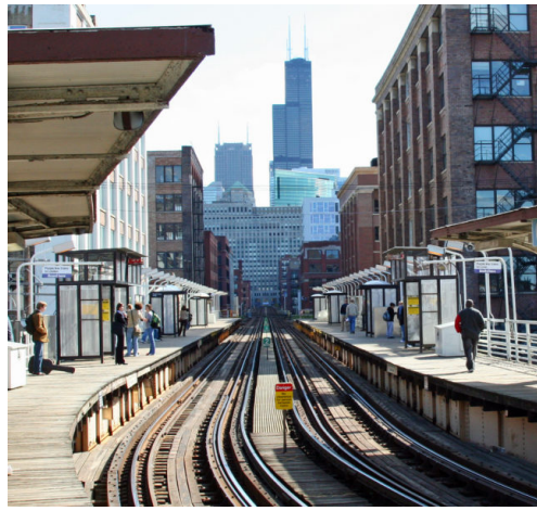
Chicago L Station

similar economic development patterns in downtown areas all across the country, with job growth greatest in the areas that are well-served by transit.