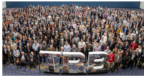
Participants at the 99th annual TRB conference in D.C.

Enjoy this week's plentiful content -- new webinars, events, and jobs for all!