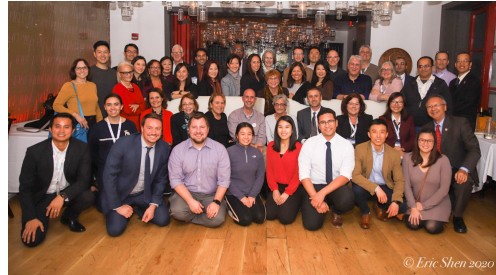
Members of the METRANS team at TRB 2020 in Washington, D.C.